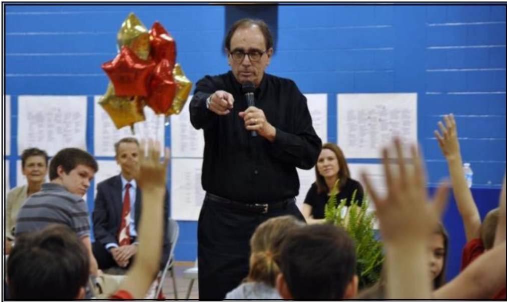
R.L. Stine at Union Elementary